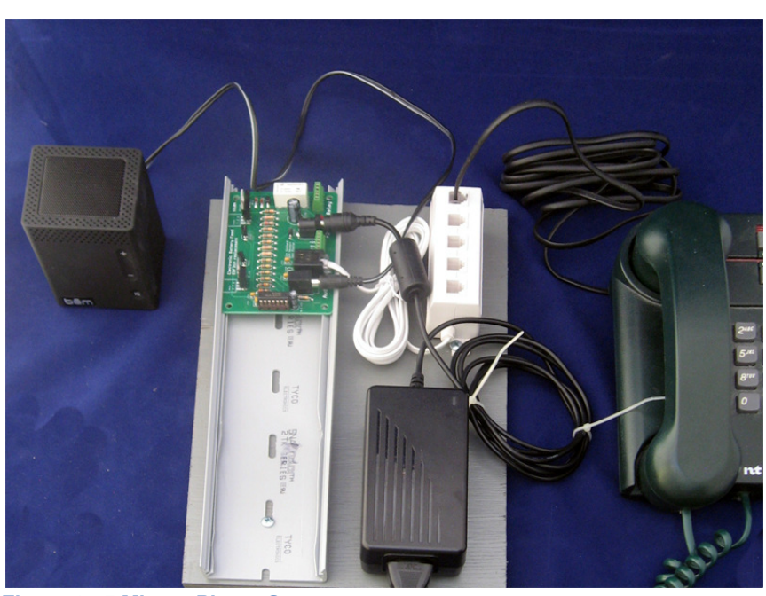
Figure 1 - 5 Minute Phone System