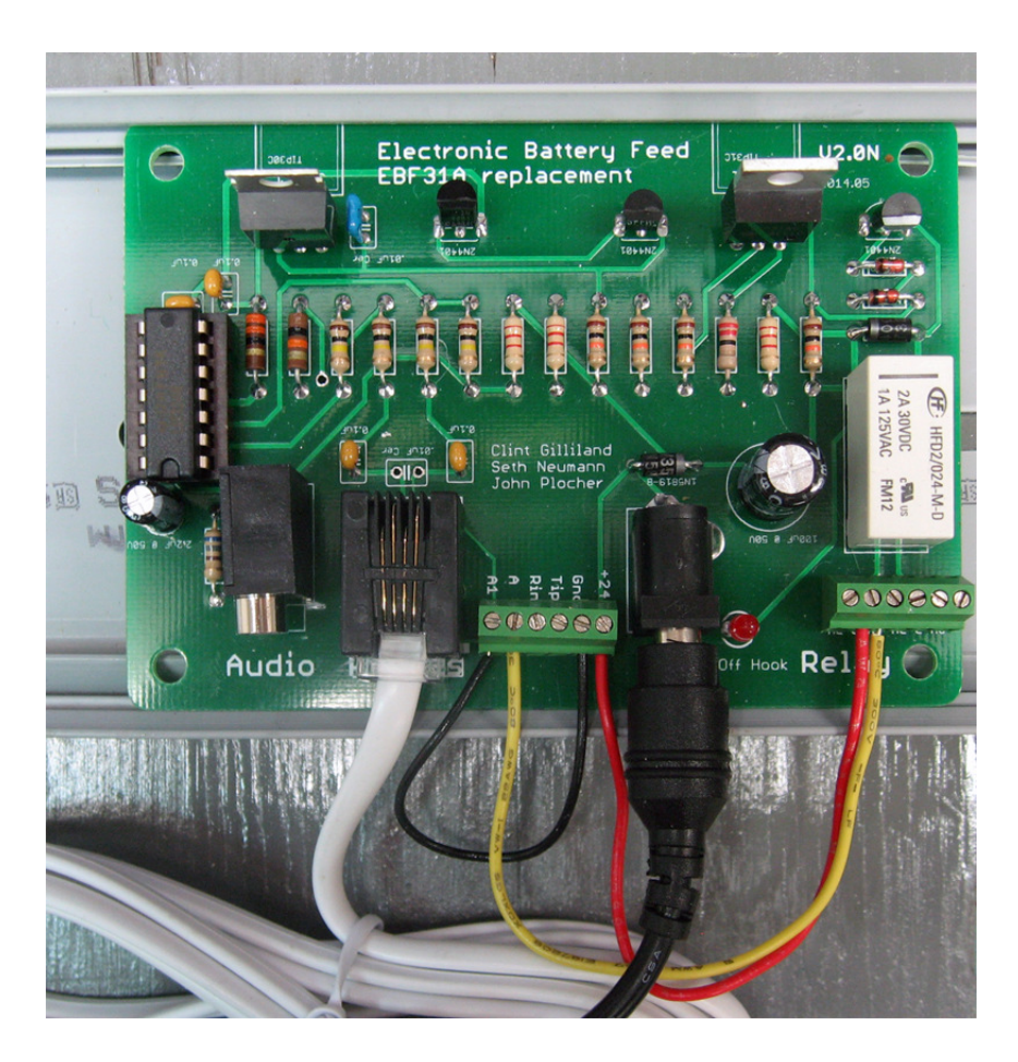
Figure 3 - Off Hook Indicator Wiring